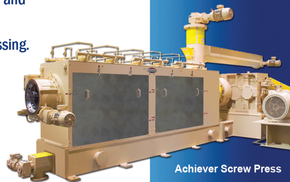
Achiever Screw Press