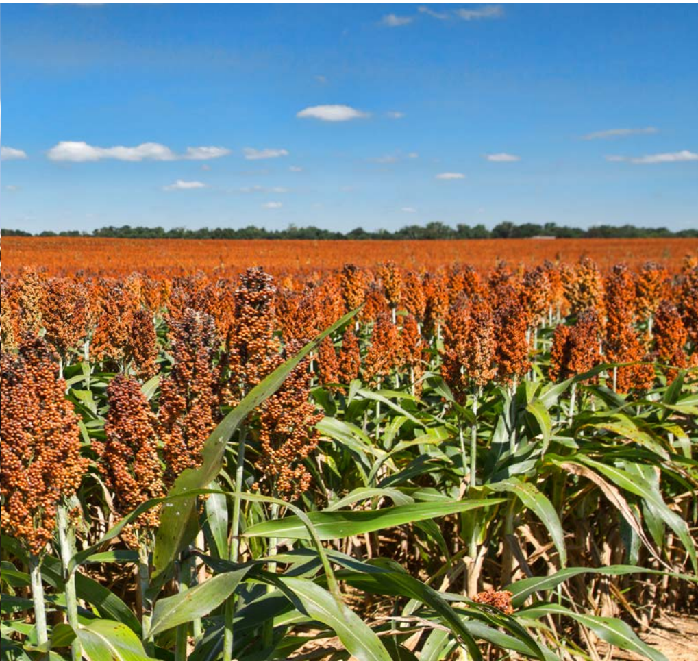
SWEET SORGHUM IS A VARIETY OF GRAIN SORGHUM AND THRIVES IN HOT, DRY CLIMATES, MAKING IT A VALUABLE POTENTIAL FEEDSTOCK FOR BIOFUELS PRODUCTION

up to 60 days. The hybrid varieties can be grown on fallow sugarcane land and processed using the same equipment, and they require less water than sugarcane. In its agricultural plan for 2012 to 2013, Brazil has announced it considers sweet sorghum a strategic crop.