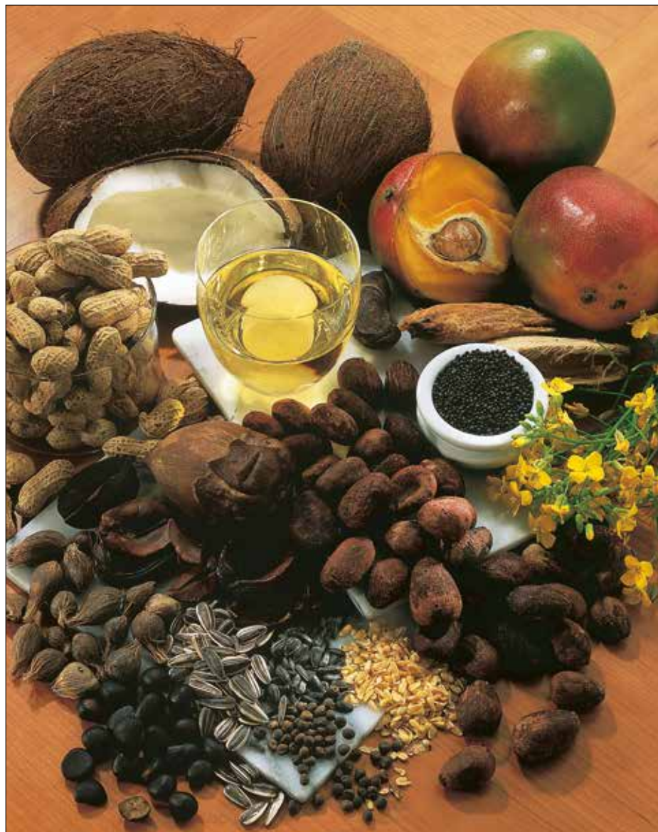
EXAMPLES OF EXOTIC FATS INCLUDE ILLIPE AND SHEA, AS WELL AS MANGO KERNEL BUTTER, SAL, DHUPA AND MAHUA

Exotic fats are defined as a group of fats obtained from wild, uncultivated crops. This characteristic means that crop sizes are extremely variable year to