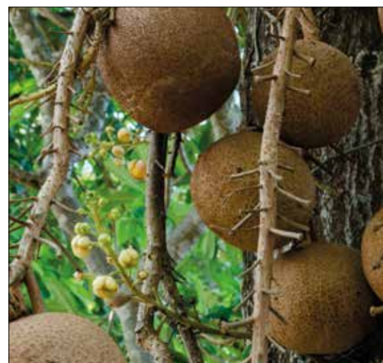
A FRUIT BUNCH GROWING ON A SAL OR SHOREA ROBUSTA TREE

Mango fat is solid, resembling cocoa butter in its physical and chemical characteristics. Once refined, the butter is edible and can be used as a CBE. Mango stearine can also be produced through the processes of solvent fractionation or press fractionation. The product is used as a CBE and replacer.